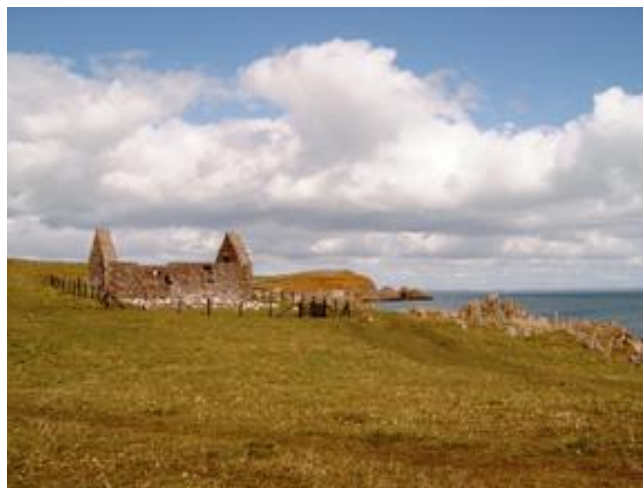
St Ninian's Chapel behind the harbour frontage street in the Isle of Whithorn now stands as a restored 14th century reception chapel although excavation revealed traces of an earlier, 12th century chapel. It was used by sea-borne pilgrims visiting the shrine of St Ninian.

St Patrick founded several communities in Ireland after the middle of the fifth century. Then came the formation of similar monasteries in Wales and Cornwall. Then, in 563, St Columba (c. 521–97) and his companions landed on the island of Iona from Ireland, and introduced Irish monastic life into Scotland.