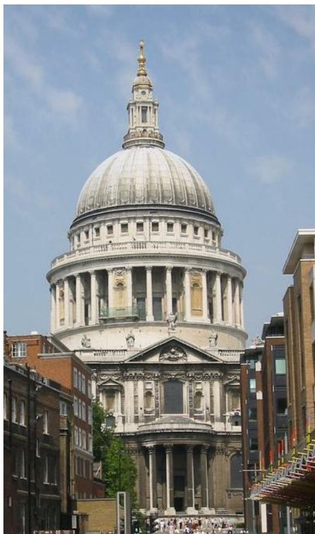
View of St Paul's Cathedral showing the phoenix relief on the south pediment

A symbol for resurrection, used by Christians but of much more ancient origin, is the phoenix – the mythical bird which, according to legend, deliberately immolates itself in its own nest so that its young might be reborn from its ashes. This symbol seemed thoroughly appropriate for the new Cathedral as it rose out of the ashes of the old. Accordingly it was used as the main design element, in conjunction with the motto Resurgam , for one of the chief sculptures of the cathedral: the pediment relief over the south portico.