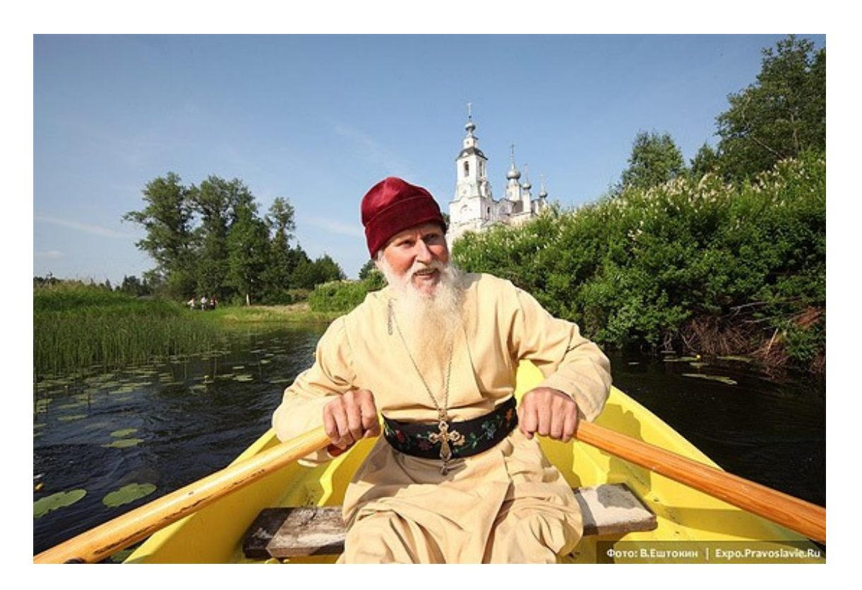
Holy Orthodoxy Restored (2011)

Samuel Huntingdon, 'The Clash of Civilisations and the Remaking of World Order', p. 184.